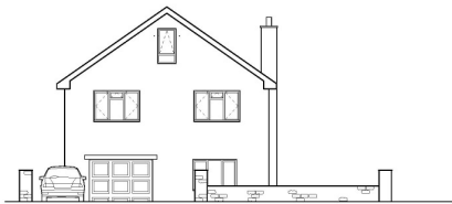
Proposed Frontage View.