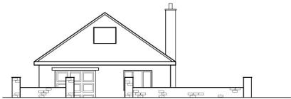
Existing Frontage View.